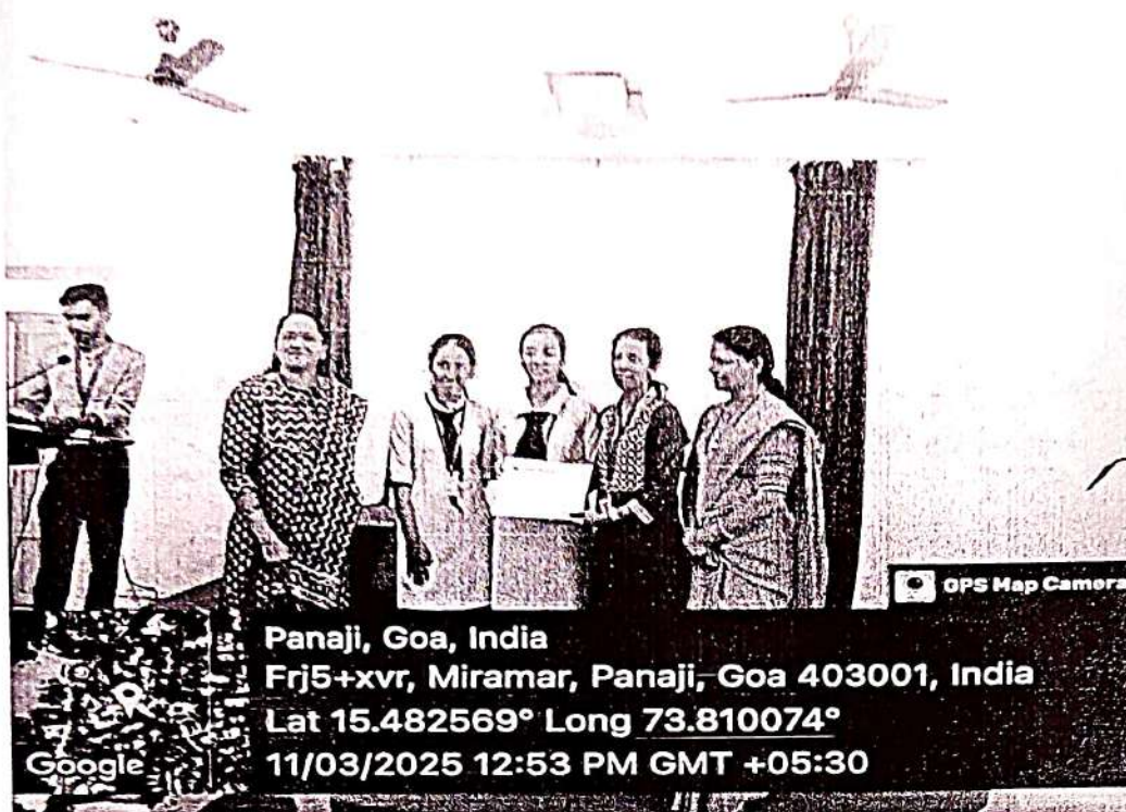
Participants of the power point presentation receiving certificate.