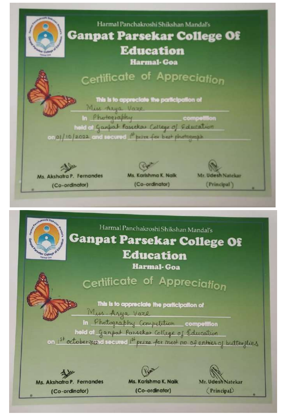
NAAC Criteria No.I/ Key Indicator 1.3, 3.3/ Metric No. 1.3.1 and 3.3.4